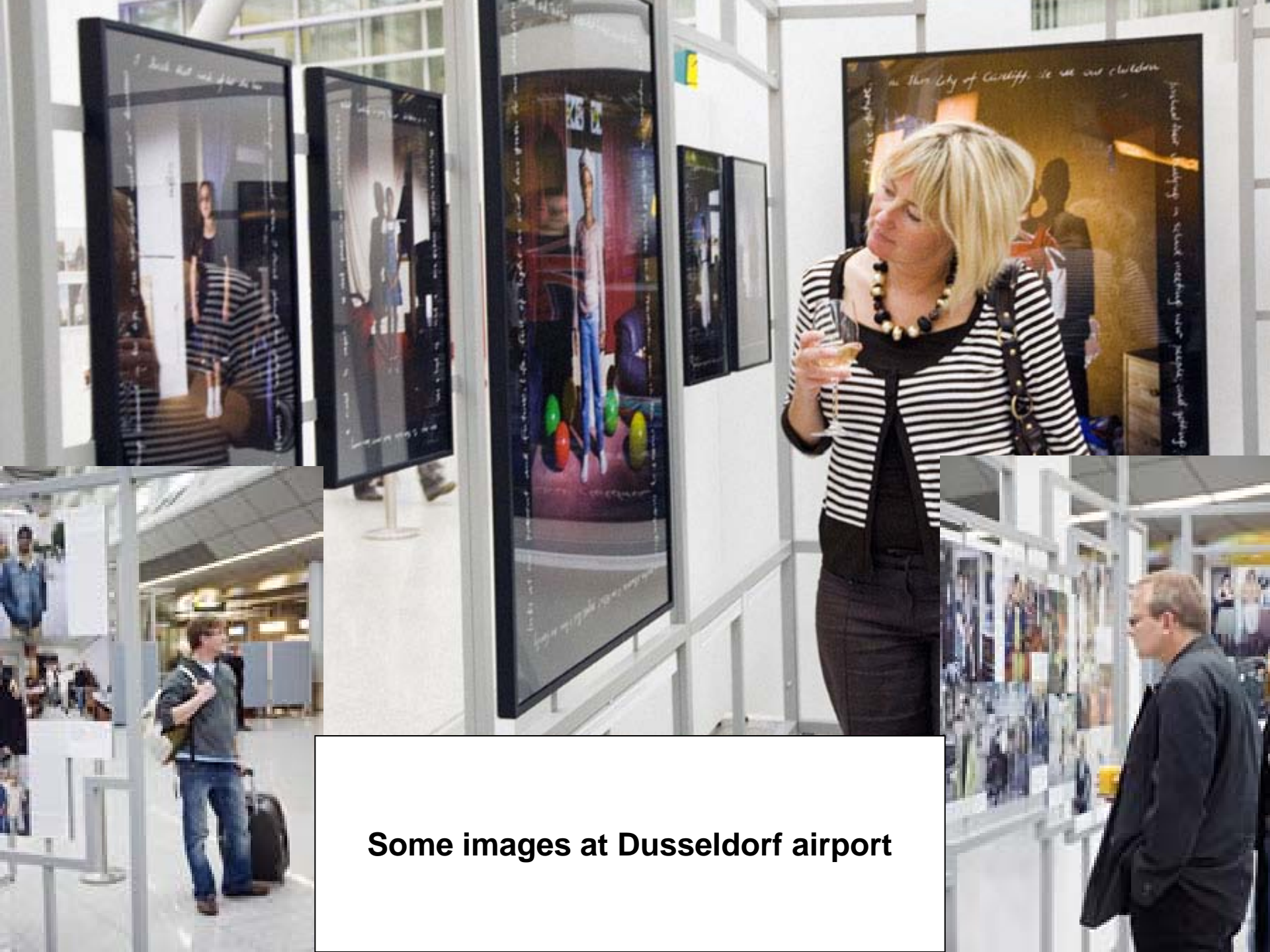
Some images at Dusseldorf airport